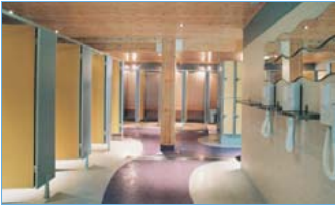
Changing room and showers.