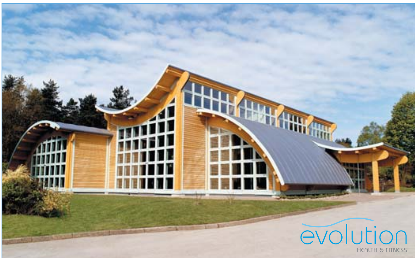
The first view visitors see of Evolution Health & Fitness leisure centre as they enter Darwin Forest Country Park.

Plus Design and Build's (PDB) architects proposed a building with a laminated timber framework. The glulam columns, curved beams and purlins are constructed from Scandinavian whitewood from sustainable, managed forests. Larch is used for the low maintenance exterior cladding