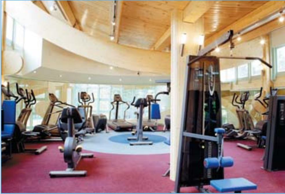
Gymnasium with a wide range of the latest fitness equipment.