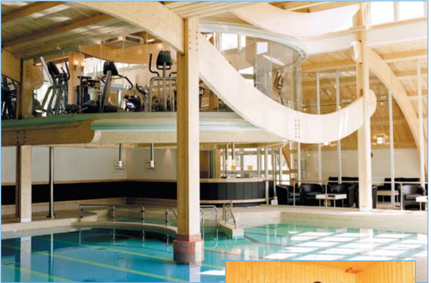
The gymnasium dramatically suspended above the swimming pool.