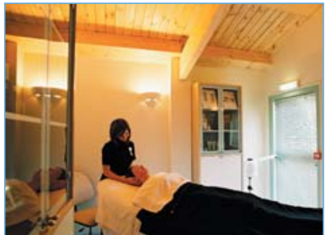
Beauty treatment and therapy area.