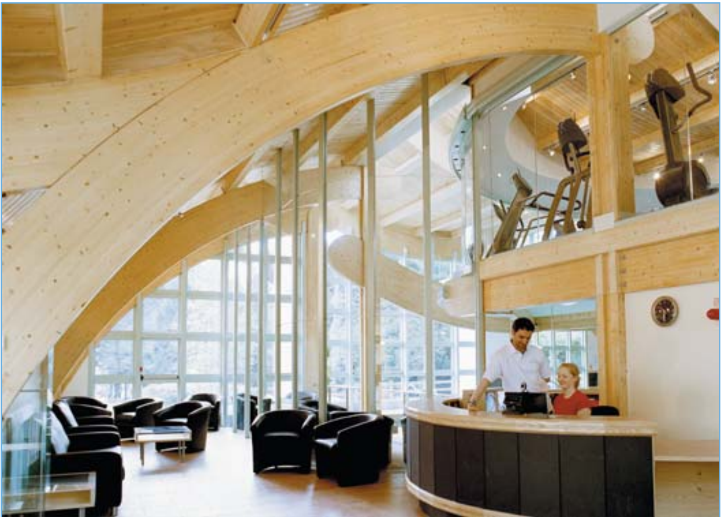
Reception and relaxation area.