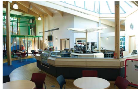
Reception area and octagonal desk - positioned to ensure every function is easily controlled

Glazed pods, seemingly at random on the walls and in the roof, have however been positioned over key points in the building and play frame where children congregate. These pods not only add to the user's sense of excitement and reveal to outsiders the fun being had within; they also bring natural light to points where it is needed most.