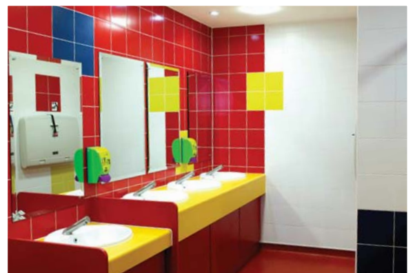
Child friendly toilets