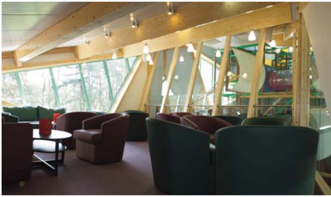
Mezzanine viewing room