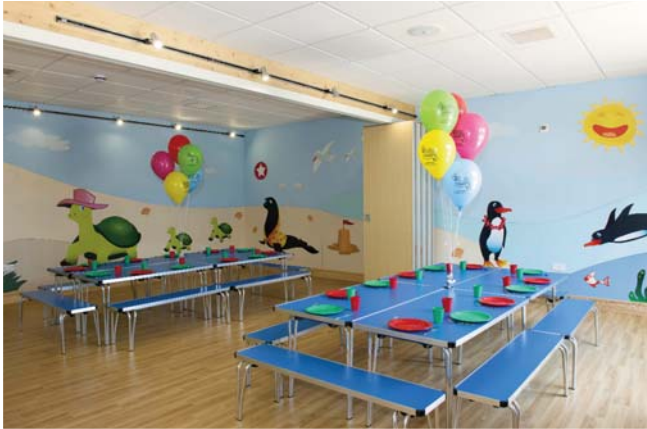
The two party rooms with acoustic wall folded back